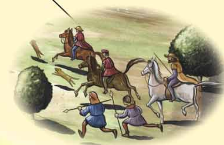
The Park's Past