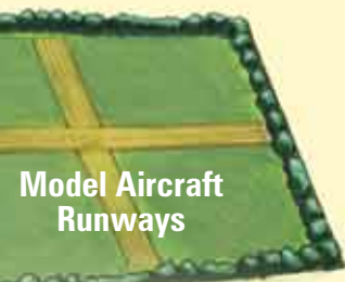
Model Aircraft Runways