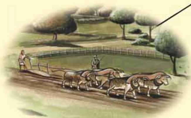
Ridge and Furrow