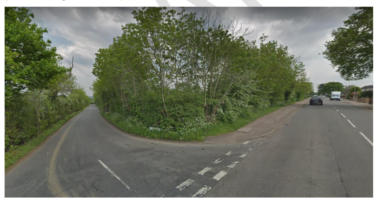
View 2: east along St James Road and south-east along Newgatestreet Road.

Along Newgatestreet Road, some thinning of the hedgerow will be necessary in order to achieve vehicular access as well as secure the visibility of the communal green referred to under objective 1. However, proposals should retain as much of this greenery as possible, consistent with the objectives in this Brief.