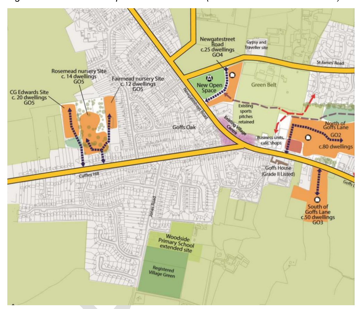
Figure 3: Indicative Concept Plan for Goffs Oak

The Broxbourne Local Plan 2018-2033 (adopted June 2020) allocates four greenfield extensions to the village of Goffs Oak, as shown within the indicative Concept Plan below. As shown above, the site was released from the Green Belt. The 'exceptional circumstances' for release of the site from the Green Belt related to the provision of the new open space indicated for play on the indicative Concept Plan below<sup>1</sup>.