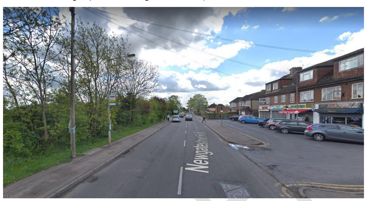
View 1: South-east along Newgatestreet Road with the Site on the left and Mason's Parade on the right (source: Google streetview).

The Local Plan states at paragraph 8.6 that "a limited amount of housing is considered appropriate in order to open up the field for community uses, <u>linked to the existing playing pitches behind the village centre</u>." Visual as well as physical linkages between the existing pitches and the new communal green should be provided. The illustrative design solution at Appendix A demonstrates how the proximity and inter-visibility between the two spaces could be maximised through effective layout of residential dwellings and open space.