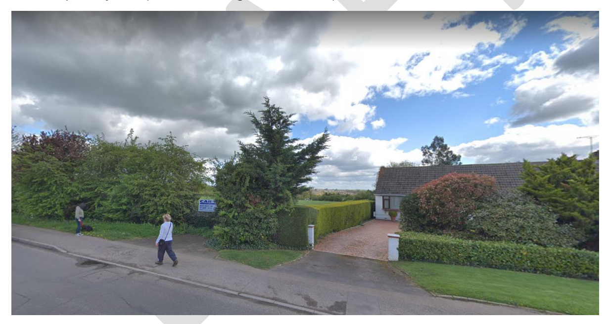
View 3: looking north from Newgatestreet Road across Windrush to the Site and the landscape beyond.

Sustainable urban drainage (SuDs) provision<sup>4</sup> should take advantage of the sloping nature of the site. It is likely that a pond and/or a natural soakaway (swale) will be located at the lowest point of the site. The landscaping and planting of this area will be a major contributor to achieving net ecological gain for the site as a whole through appropriate management (N2, Local Plan policy NEB1). Depending on the results of community engagement, it may also be appropriate for an area of the communal green to be given over to enhanced habitat provision.