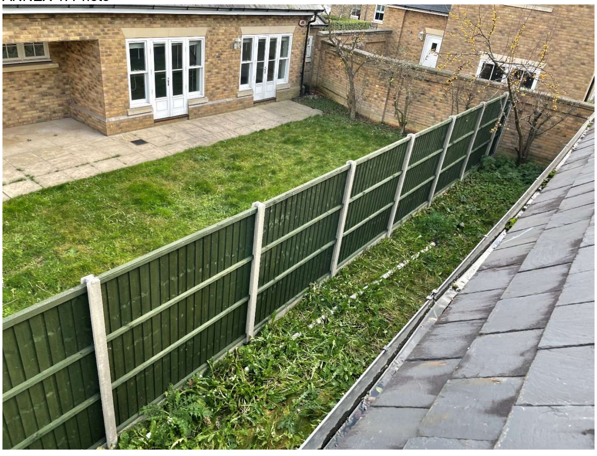
ANNEX 1: Photo