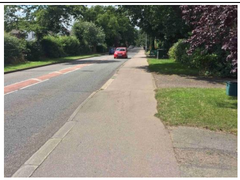
Photo 2.2 – Cuffley Hill pedestrian footway leading east to Cuffley Railway Station