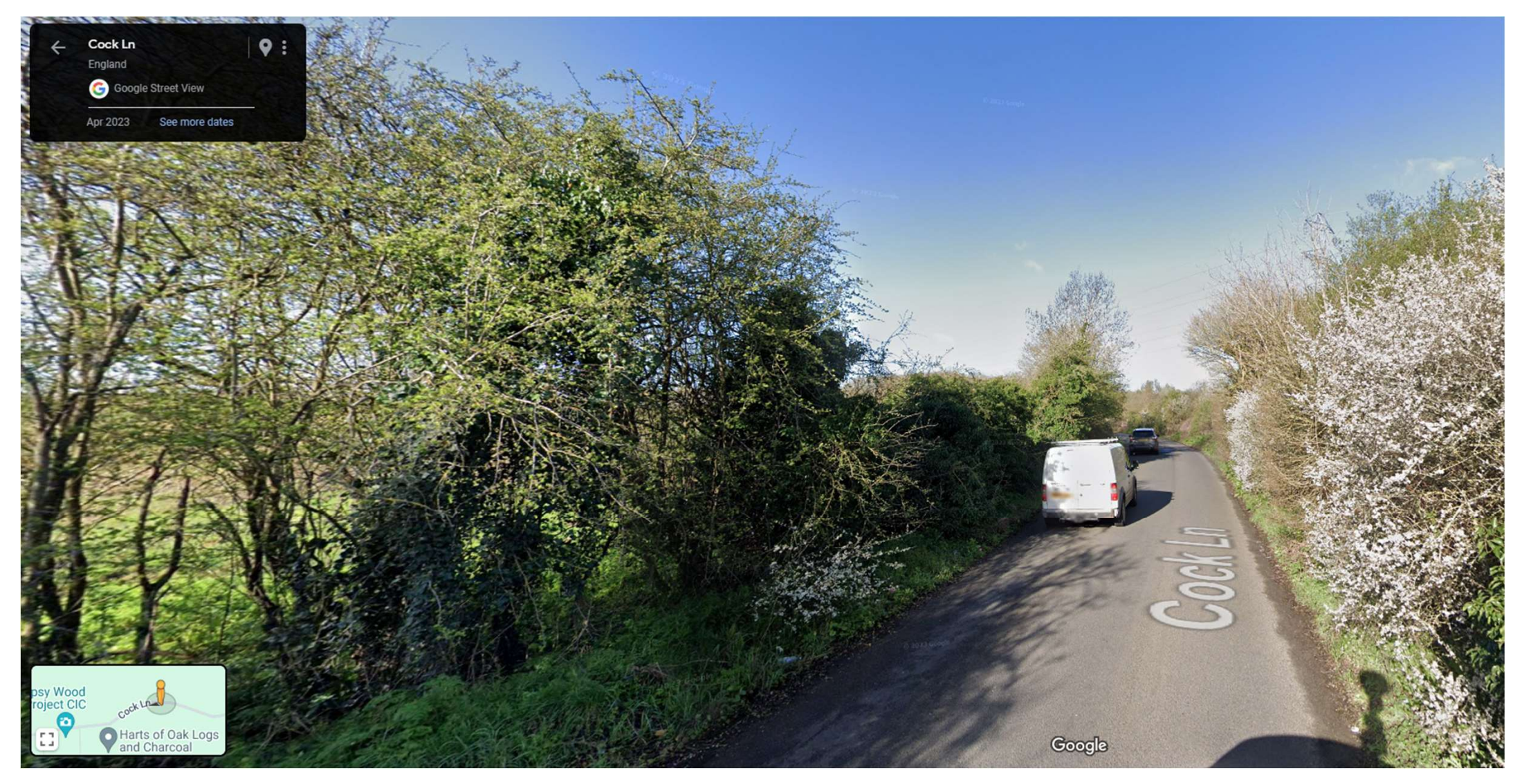
COCK LANE LOOKING WESTWARDS TRAVELLING TOWARDS SITE