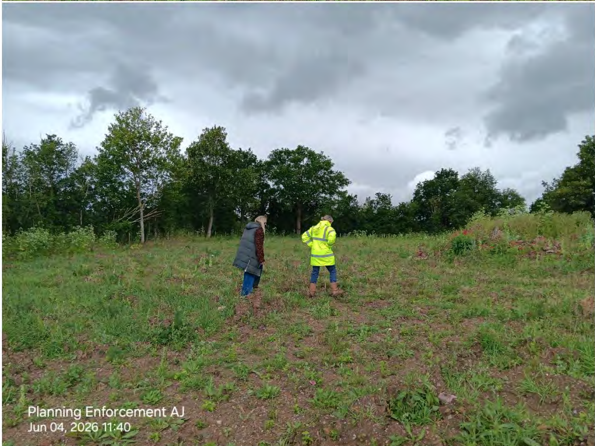
Planning Enforcement AJ Jun 04, 2026 11:40