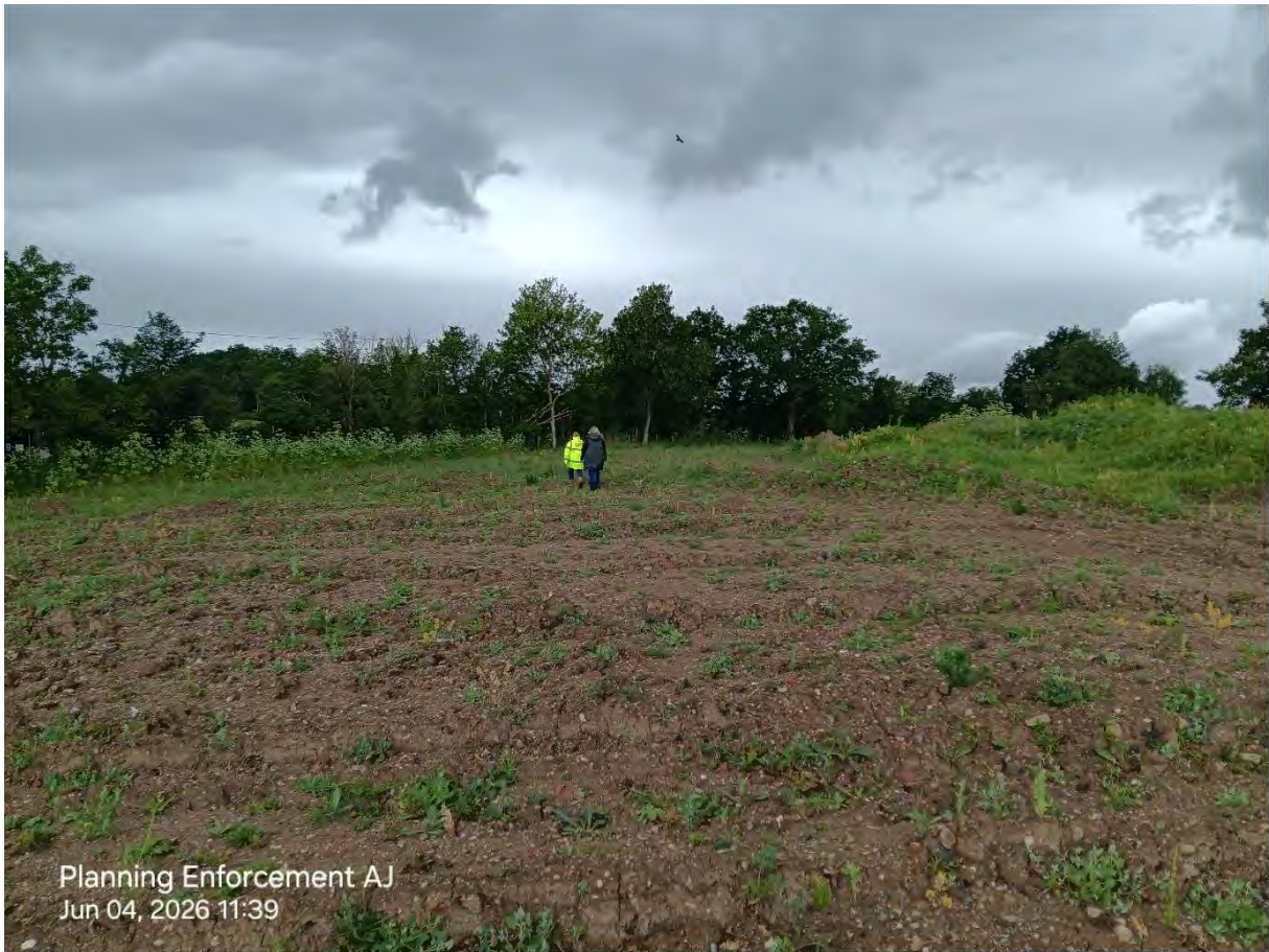
Planning Enforcement AJ Jun 04, 2026 11:39