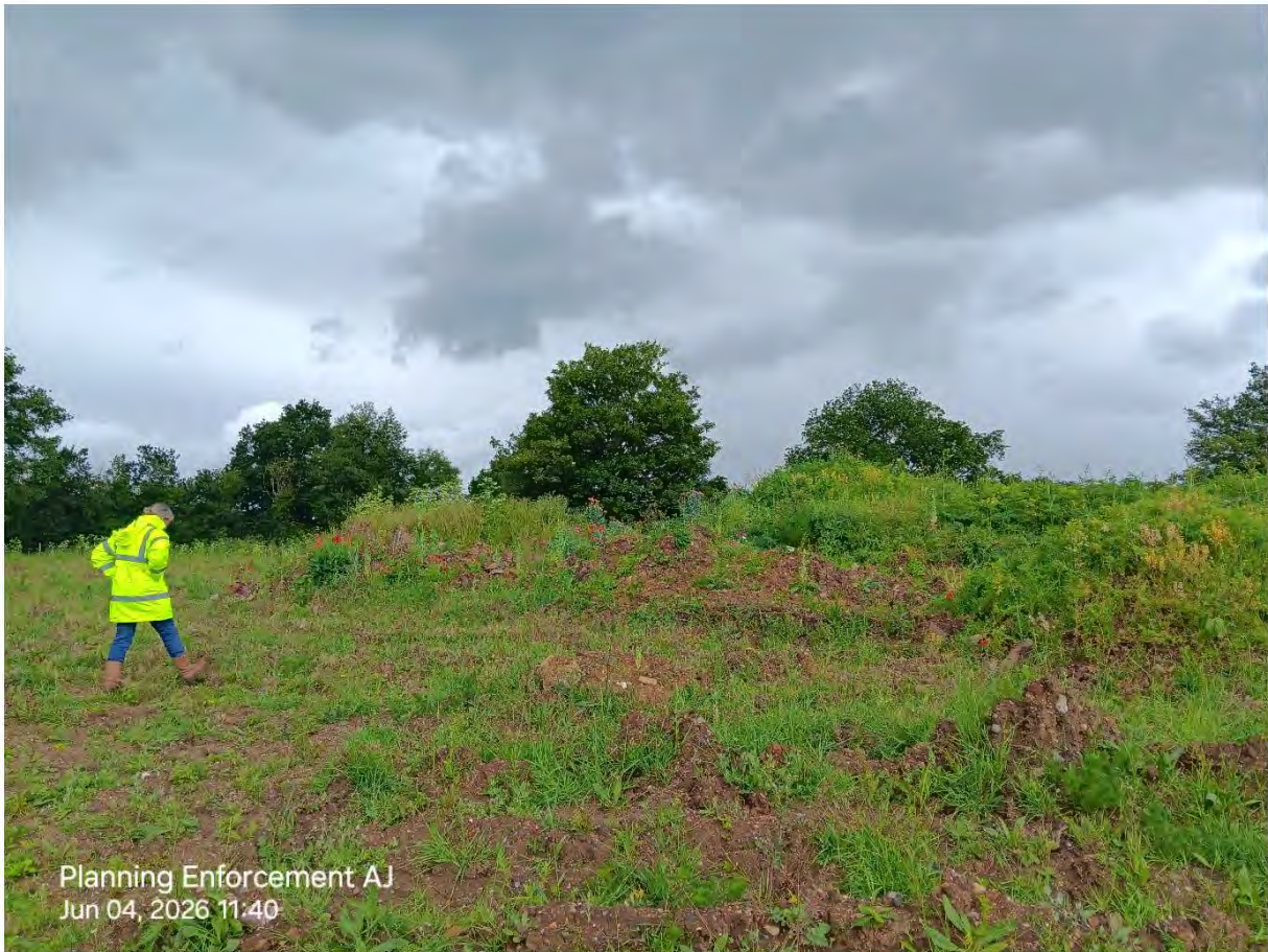
Planning Enforcement AJ Jun 04, 2026 11:40