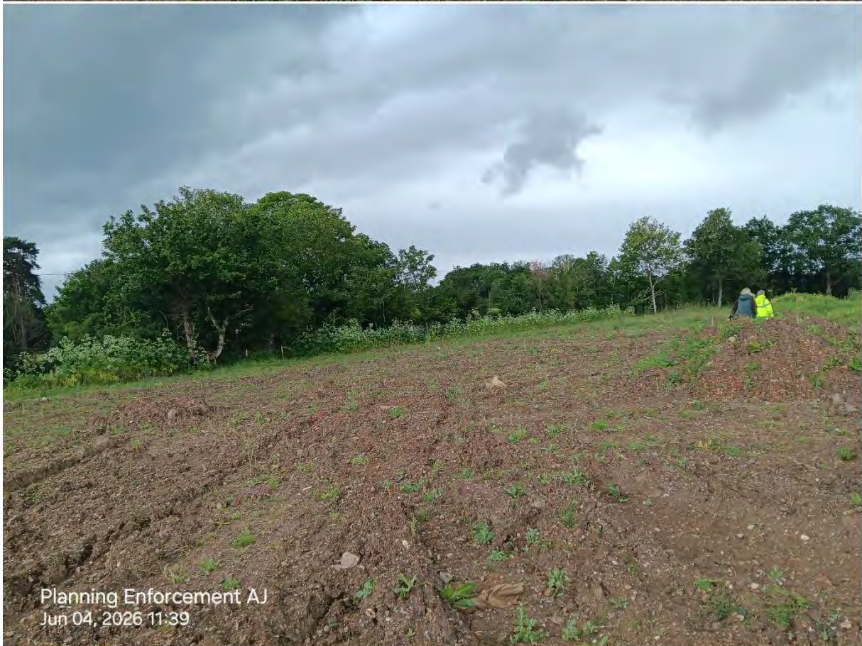
Planning Enforcement AJ Jun 04, 2026 11:39