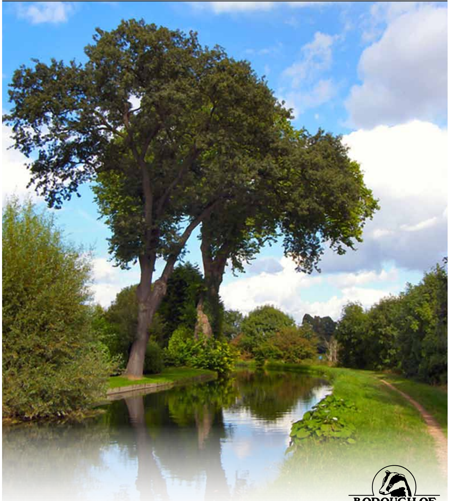
The New River

This document provides an overview of service performance within the Borough of Broxbourne.