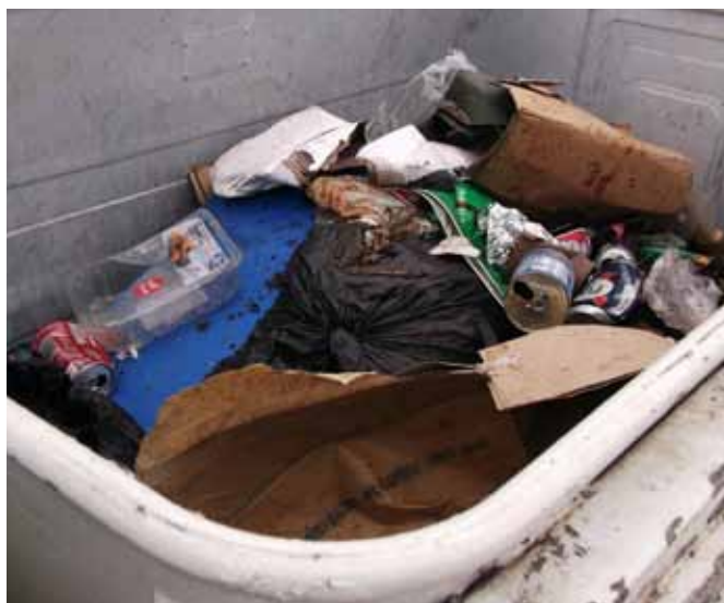
Above: Waste fly-tipped in a recycling bank at an NRC. Evidence was found and a fixed penalty notice issued.