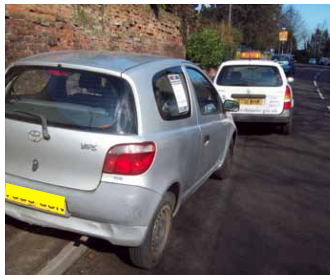
Above: Verge parking in Churchgate, Cheshunt. A notice was placed on the vehicle to inform the owner they should not park in this location.